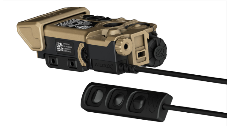
PRODUCT ILLUSTRATED WITH OPTIONAL LASER SAFETY VISOR** AND INCLUDED ERGOCTO Xe ACTIVATION KEYPAD