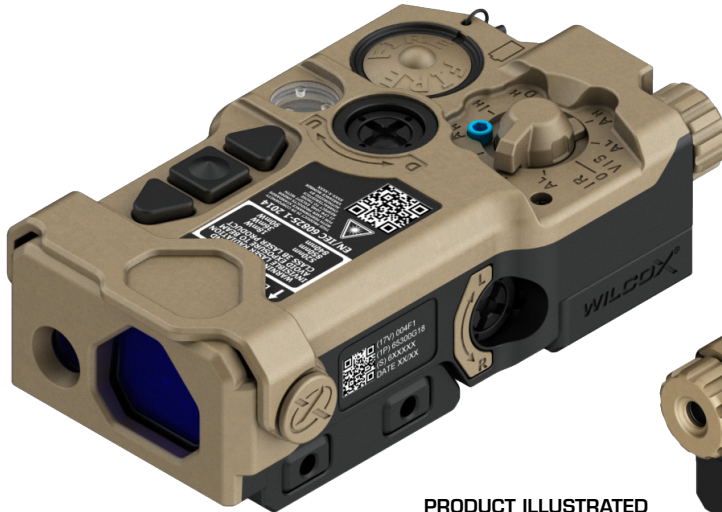
PRODUCT ILLUSTRATED IN COYOTE (-C) WITH LASER SAFETY HOOD OPEN

RUGGEDIZED AIMING/ILLUMINATION DEVICE - ENHANCED - LOW POWER