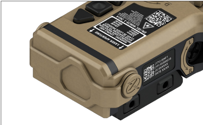
PRODUCT ILLUSTRATED WITH LASER SAFETY HOOD CLOSED