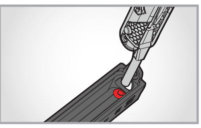
Remove & install front sight